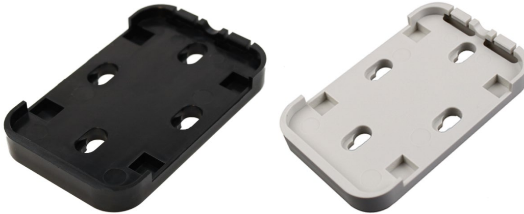
Snap-in holder (exemplary illustrations)

Mounting solution for TWN3 and TWN4 MultiTech desktop readers